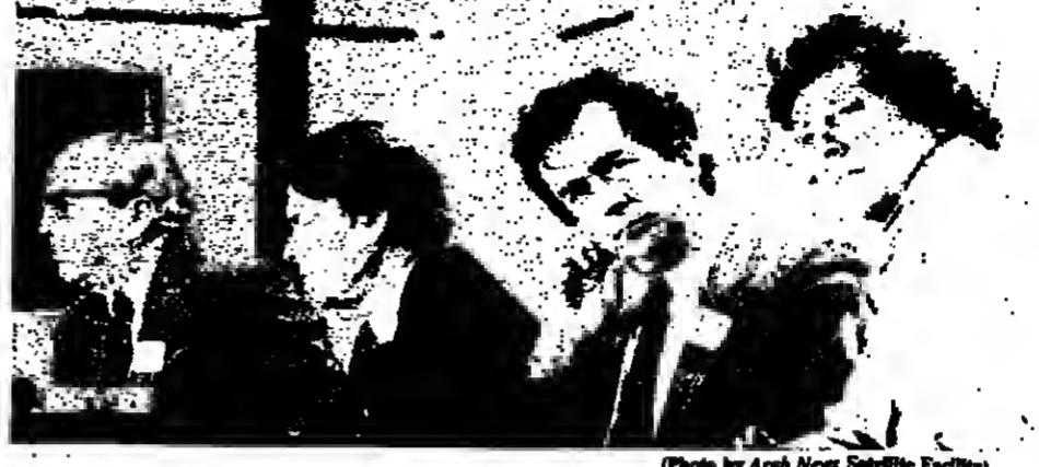
NEW PARTY: Roy Jenkins (left), David Owen, William Rodgers and Shirley Williams launch their new Social Democratic Party in London Thursday.

the trade unions, Mrs. Williams added: "For the first time in Britain a party will be breaking with all the major interest groups." The SDP is accused by the two major parties of trying to be all things to all people and woolly on policy. As if to counter this, the new party announced a generalized 12-point platform. It urged a mixed economy and more positive efforts toward fairer wealth distribution, while avoiding Labor's latest plans for widespread nationalization. It also will promote women's and ethnic minority rights. On foreign policy, the SDP, which describes itself as left-of-center, is close to the Conservatives. It favors continued membership of the 10-nation European Economic Community, generally unpopular among British voters, and a strong British role in the NATO Western alliance. It also wants multilateral nuclear disarmament, not British unilateral disarmament as officially sought by the Labor Party. Meanwhile, the Labor Party has called on the defuncting members to resign their seats in the House of Commons, but under British electoral law they need not do so.